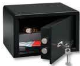
P 1 S