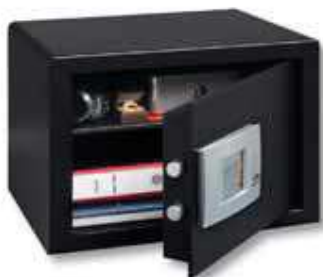
P 3 E