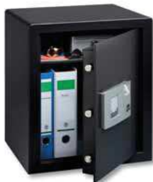
P 4 E FS