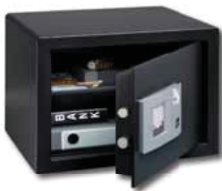
P 3 E FS