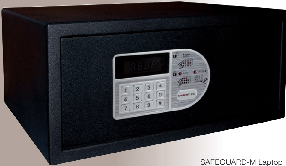
SAFEGUARD-M Laptop 15